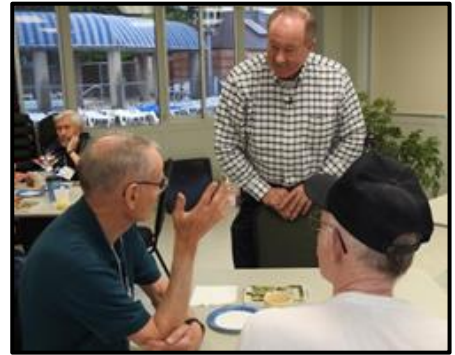
Specific Brain Health Programs: A popular topic in 2022