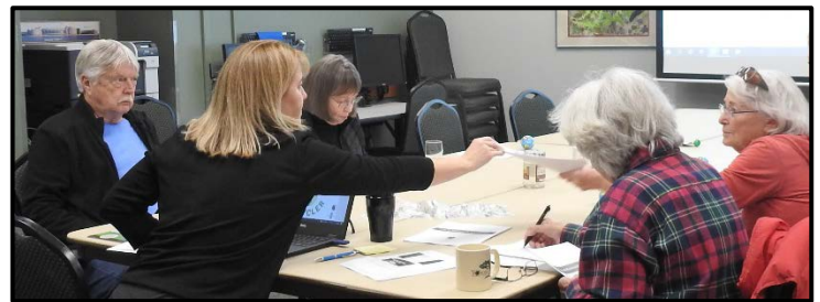
Recycling Tips & Tricks

The fourth quarter was active with a variety of programs in community education. The Alzheimer’s Association offered a class on Effective Communication Strategies for friends and families of dementia patients. A Recycling presentation drew attendees who learned new tips and tricks for their households. Scholarly Scoop was a favorite for the community. The variety of timely topics covered and quality presenters contributed to consistently high attendance numbers.