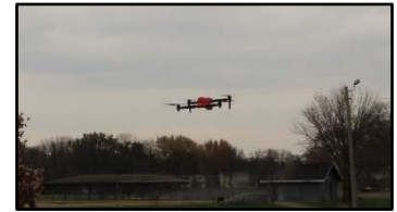
Monona Unmanned Aircraft (UA)