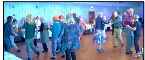
Let’s Dance Event

Senior Center fundraiser “ Let’s Dance ” drew 70.