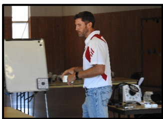
WI Council of the Blind

Monona’s Low Vision Support Group is one of only two remaining, in-person support groups for those who are blind or visually impaired in Dane County. Our group was established over three decades ago and offers tips, resources and support through the various stages of vision loss. In 2022, we averaged 12 participants at each meeting. Average numbers were as high as 17 per meeting in 2019.